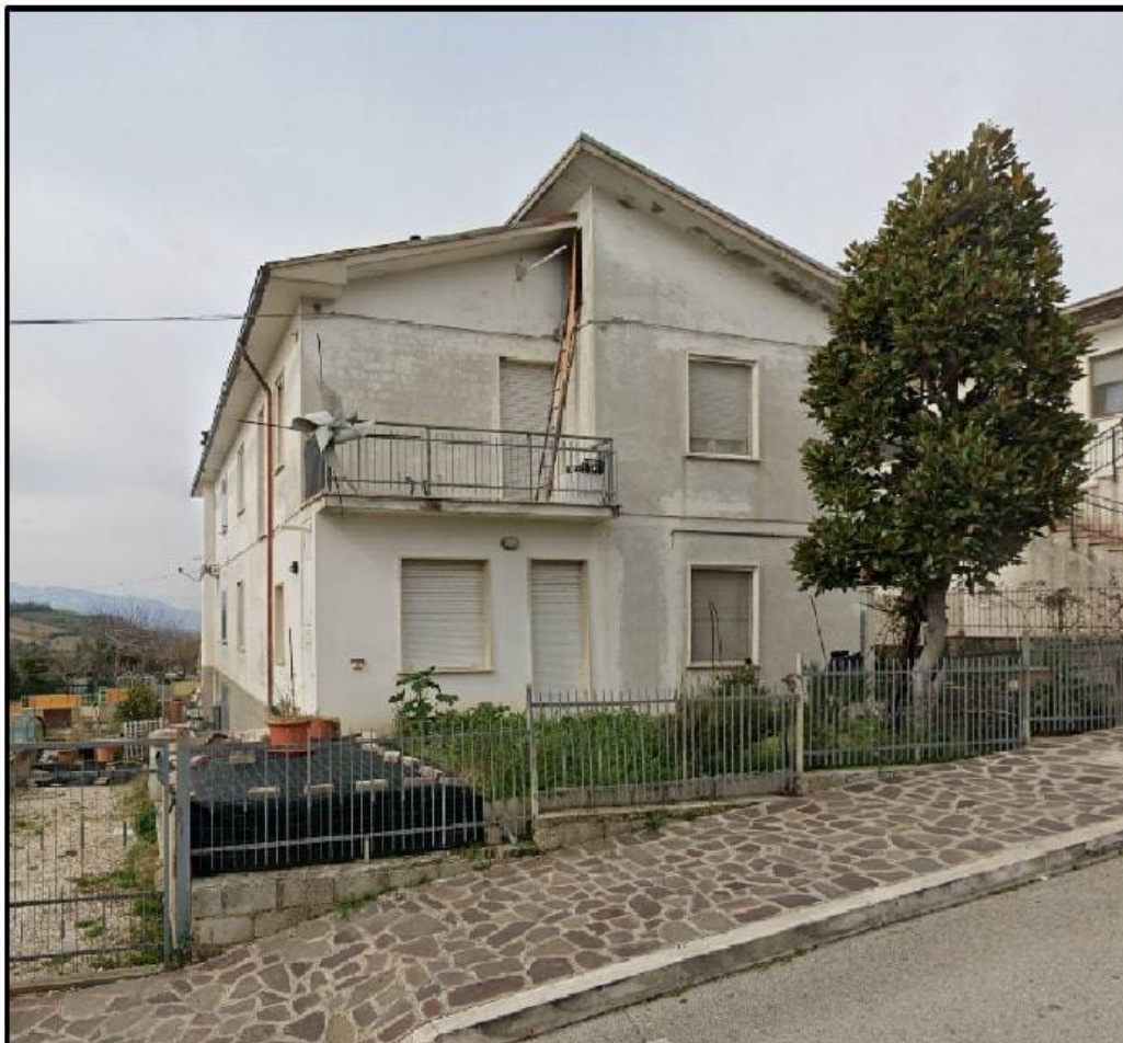
Foto esterni edificio civile

165 sq.m. | Bath: 2 | Room: 3 | Local: 6