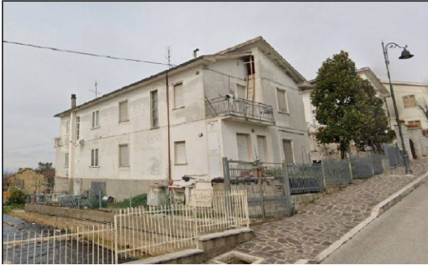
Foto esterni edificio civile