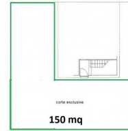
PIANO TERRA H 2,88 m